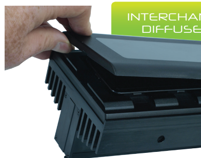
INTERCHANGEABLE DIFFUSER LENS

Installation is quick and easy, requiring only 12-32V DC / 24V AC +/- 10%.